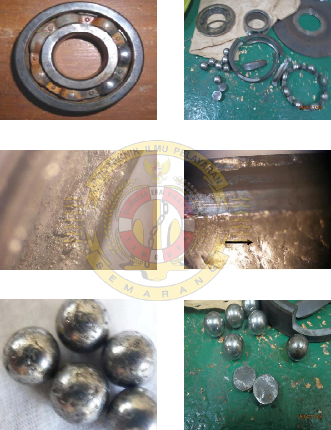
Gambar: Ball bearing yang telah rusak.