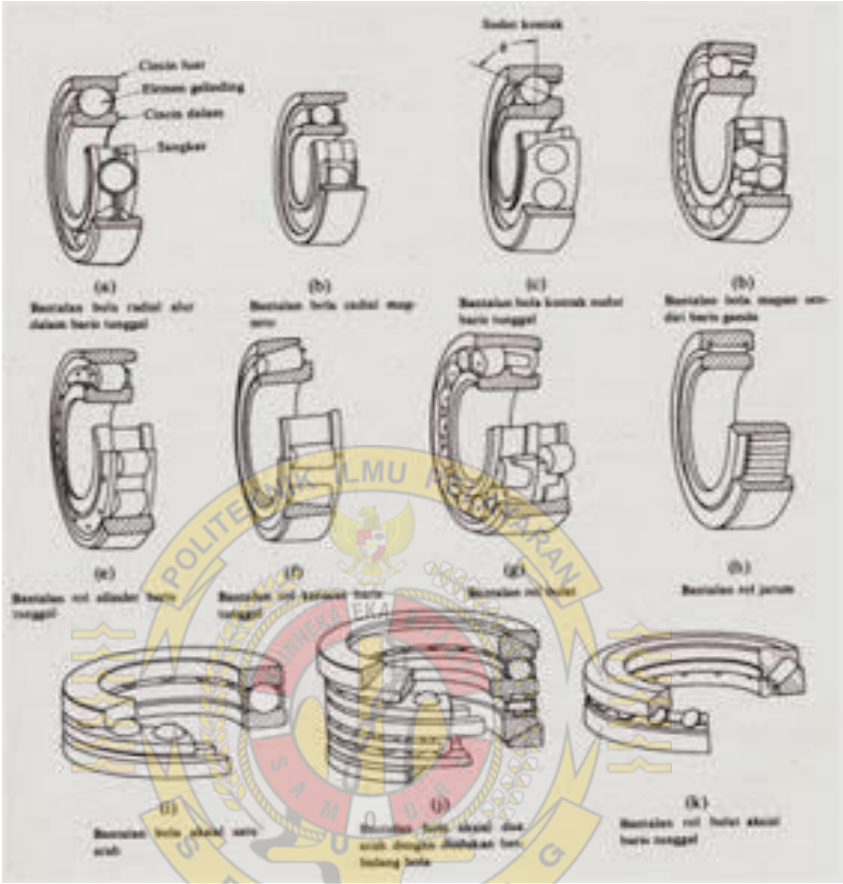
Gambar: Jenis-jenis bearing