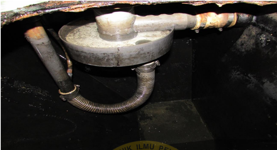
Gambar 1.1 Surface Skimmer