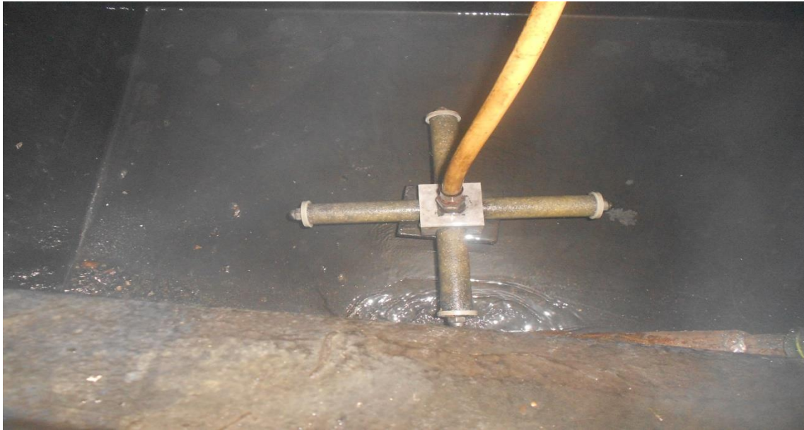
Gambar 2.3 Air Diffuser