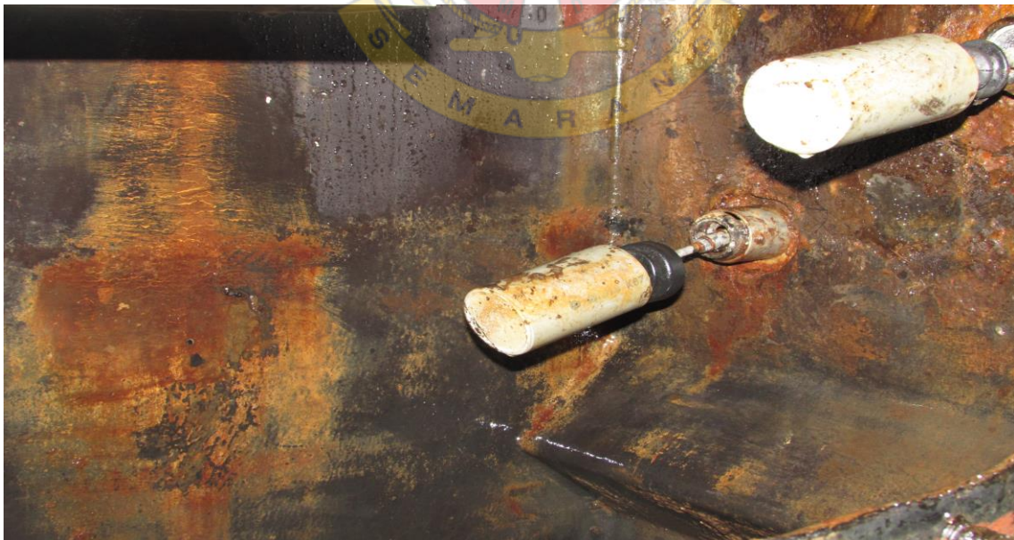
Gambar 1.2 Float Switch