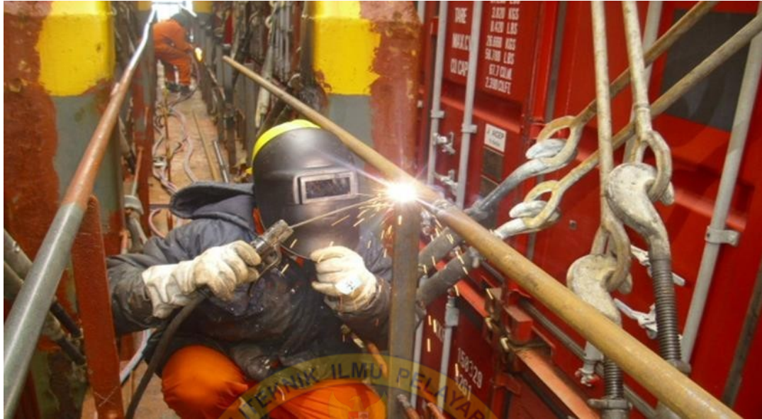
Gambar 14 Penyambungan Railing Lashing Bridge dengan cara pengelasan