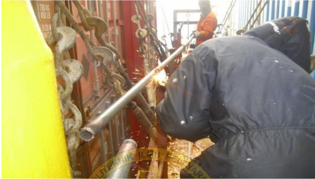
Gambar 5: Pengelasan Railing Lashing Bridge