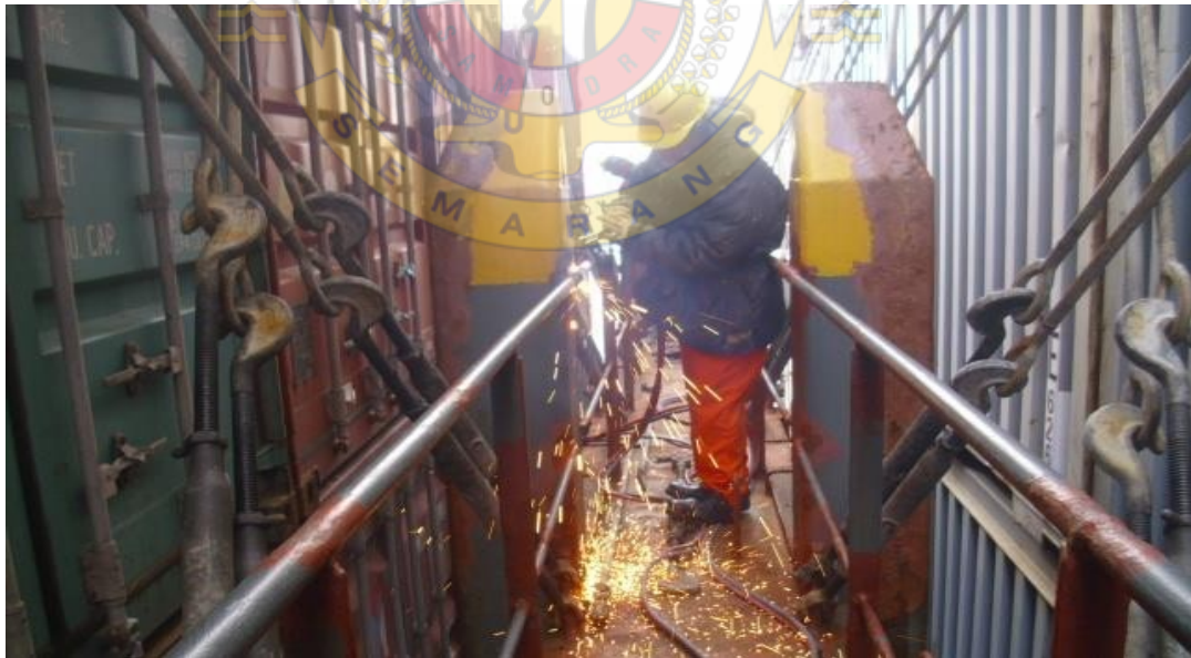
Gambar 6: Pengelasan Railing Lashing Bridge