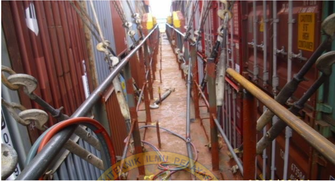
Gambar 1: Patahnya Railing Lashing Bridge