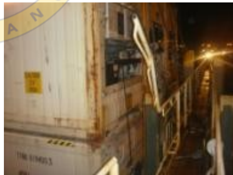
Gambar 4: Patahnya Railing Lashing Bridge