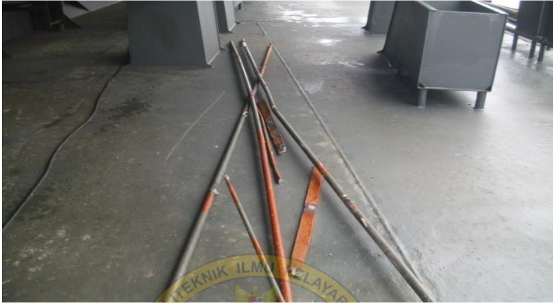
Gambar 3: Patahnya Railing Lashing Bridge