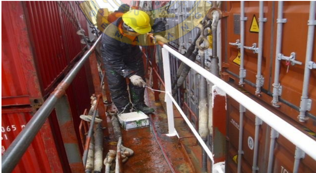
Gambar 12: Perawatan Railing Lashing Bridge