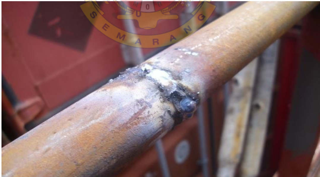
Gambar 8: Hasil pengelasan Railing Lashing Bridge