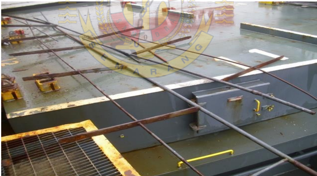
Gambar 2: Patahnya Railing Lashing Bridge