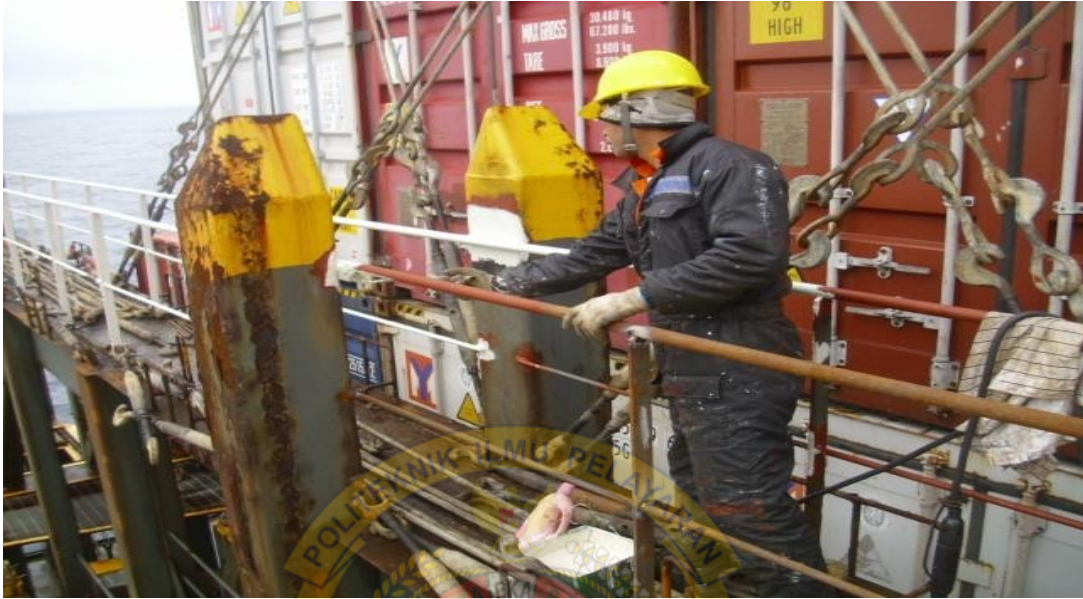
Gambar 11: Perawatan Railing Lashing Bridge