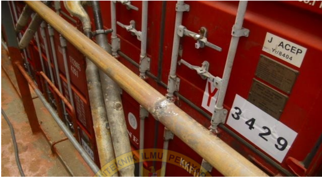
Gambar 9: Hasil pengelasan Railing Lashing Bridge