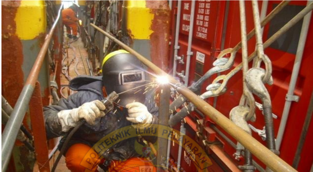
Gambar 7: Pengelasan Railing Lashing Bridge