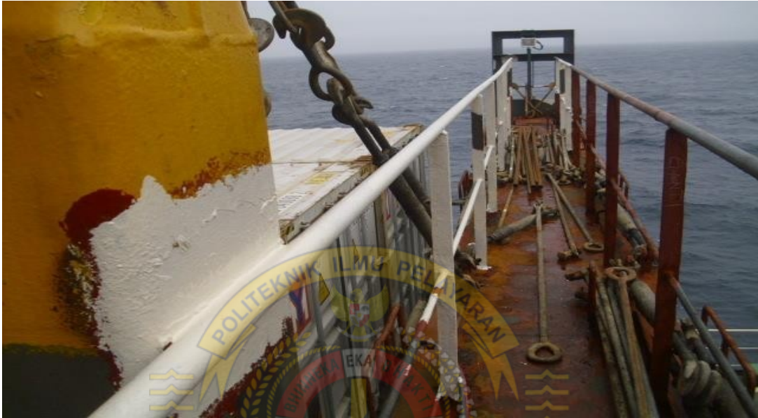
Gambar 13: Perawatan Railing Lashing Bridge