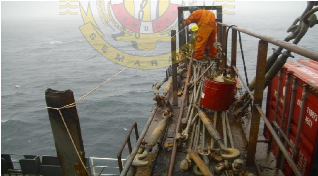
Gambar 10: Alternatif sementara pengganti patahnya Railing Lashing Bridge