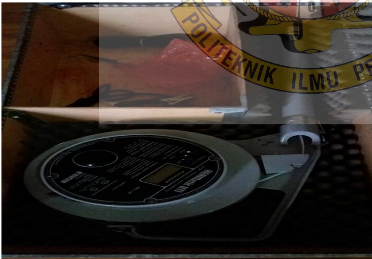
Gambar 2.1 UTI