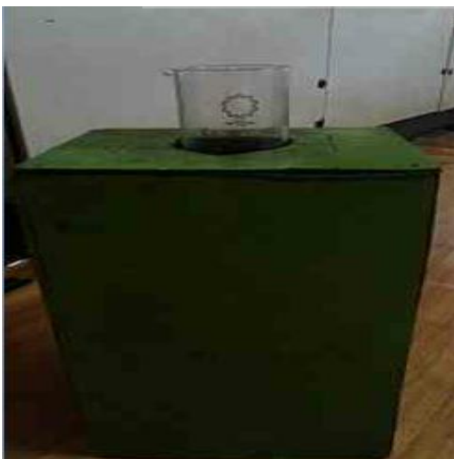
Gambar 2.8 Gelas ukur