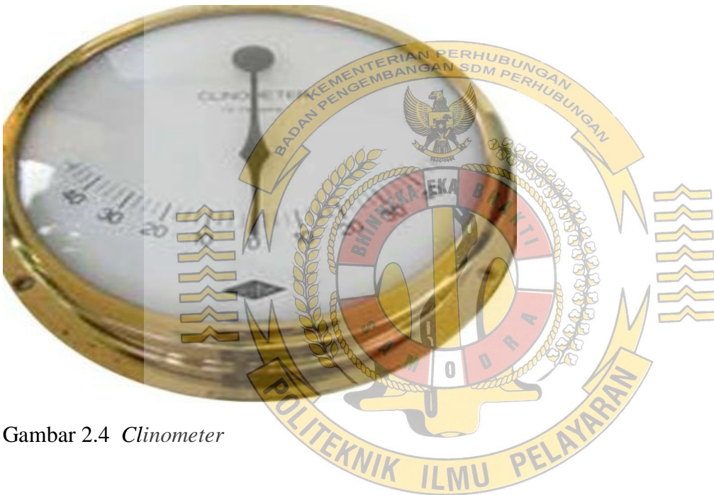
Gambar 2.4 Clinometer