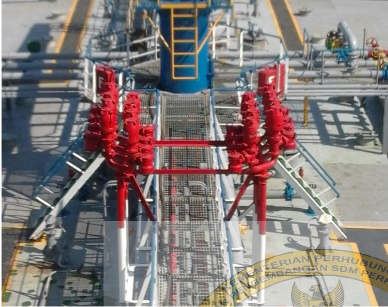
Gambar 2.1 p/v valve