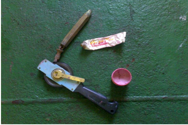
Gambar 2.3 Diptape