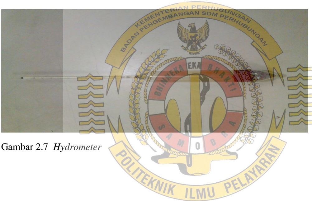
Gambar 2.7 Hydrometer