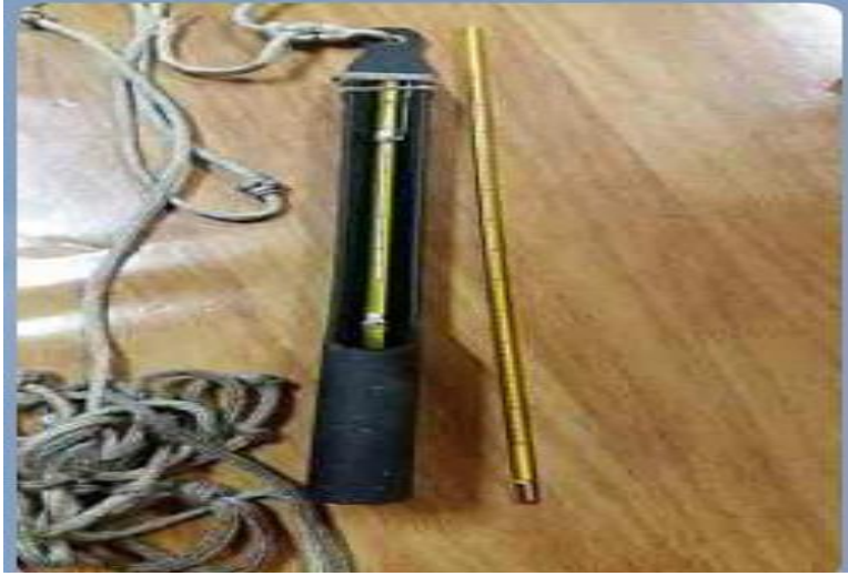
Gambar 2.6 Thermoeter