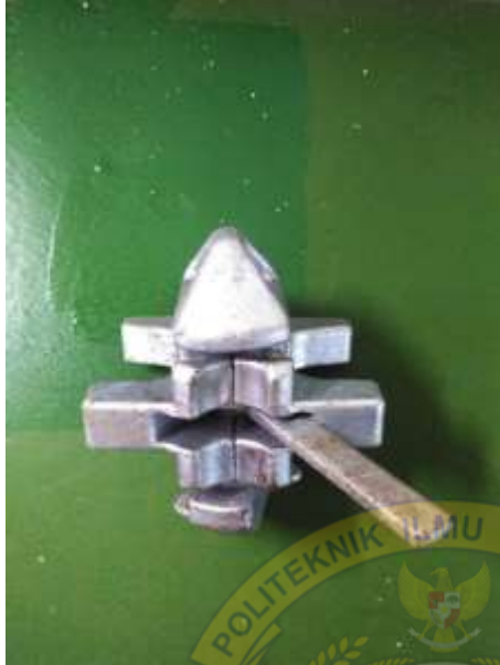
5. Gambar Automatic Twist Lock