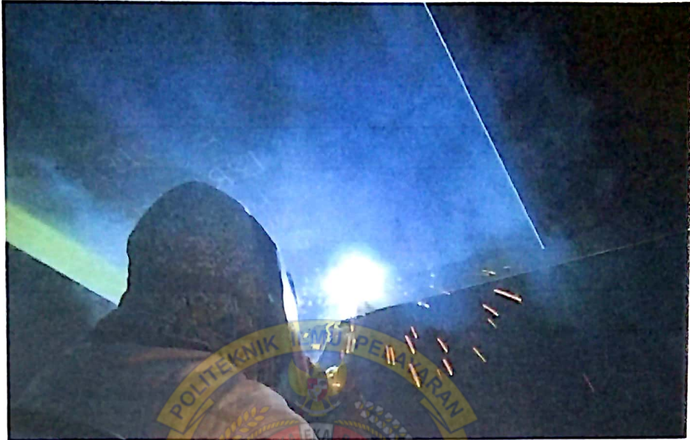
Gambar pengelasan pada tangki fresh water