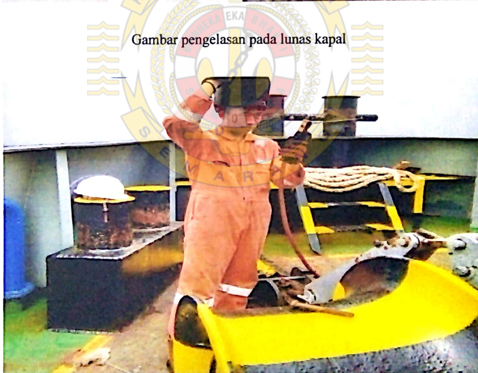
Gambar cadet saat membantu pengerjaan pengelasan