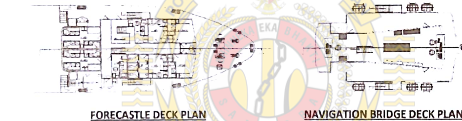
FORECASTLE DECK PLAN