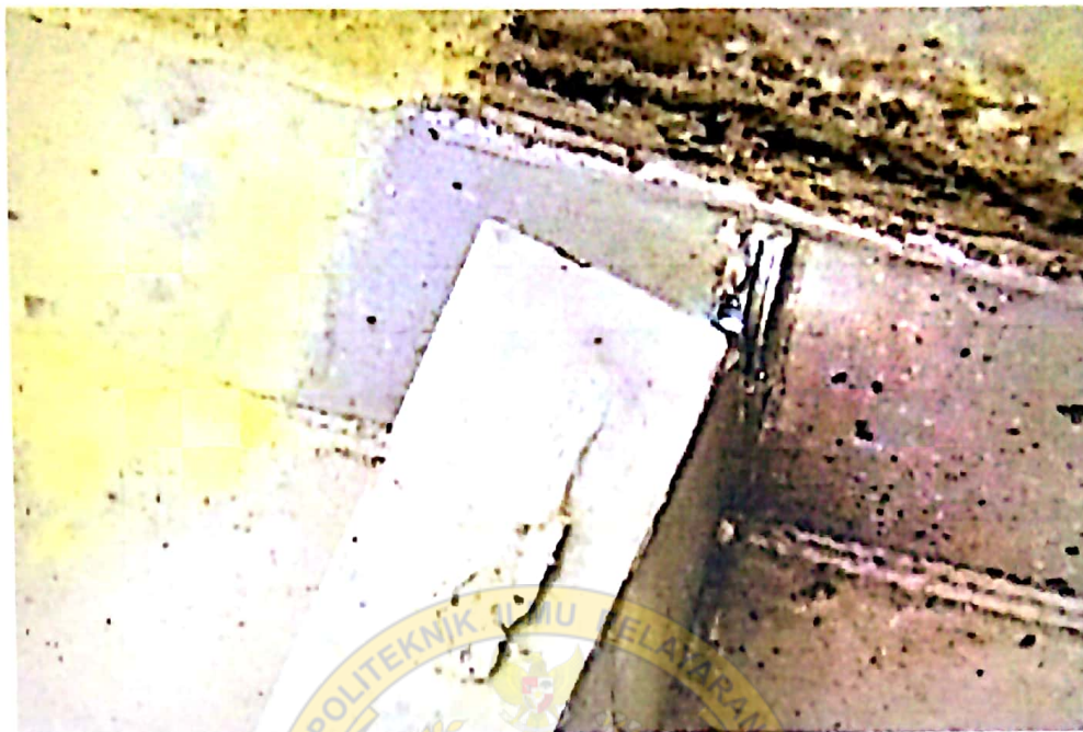
Gambar pengelasan pada lunas kapal