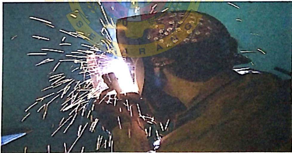
Gambar pengelasan pada tangki fresh water