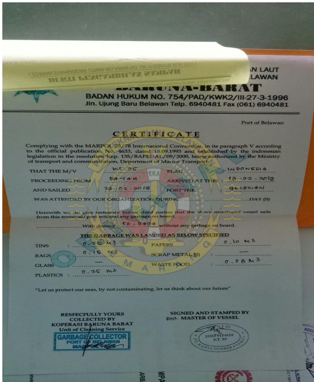
Gambar. Sertifikat dari garbage collector.