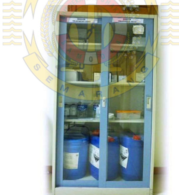
Boiler education materials