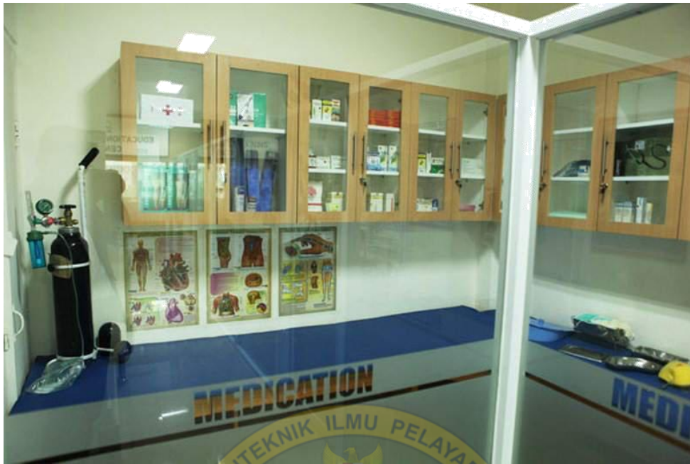
Medical education materials