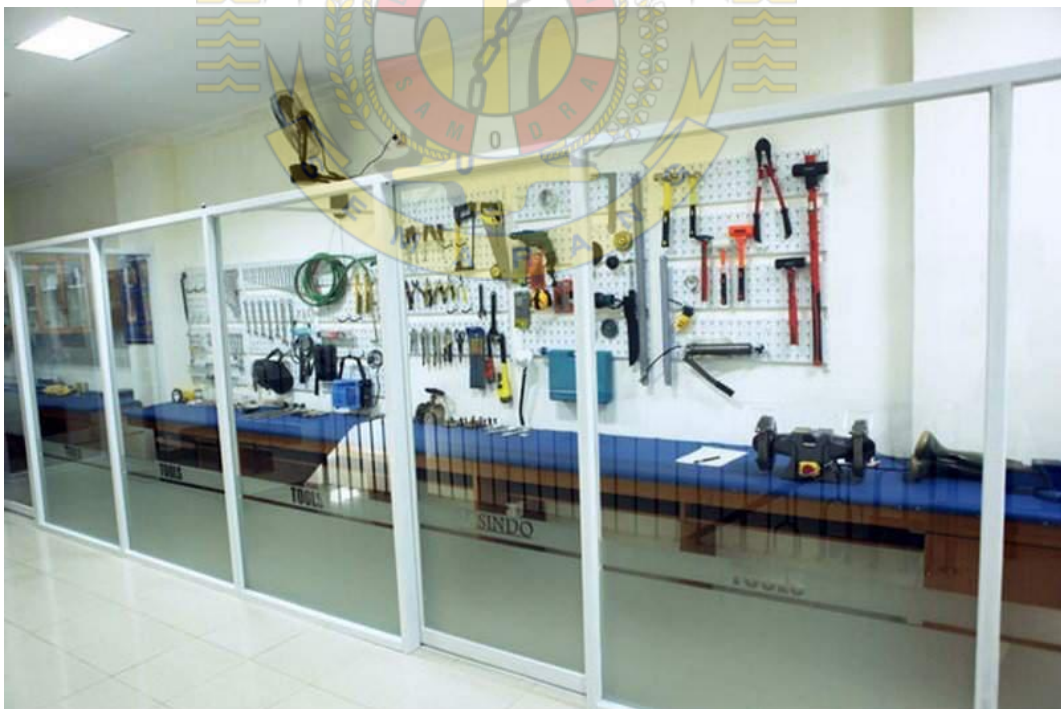
Deck rating education materials