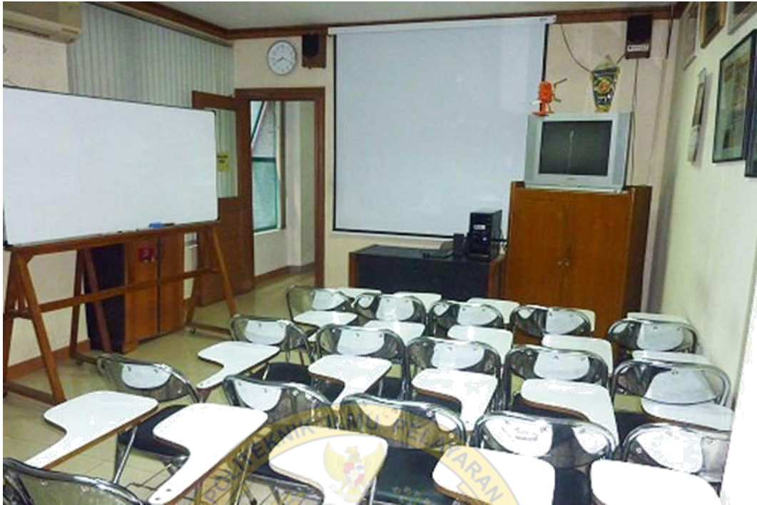
Education and training room 2