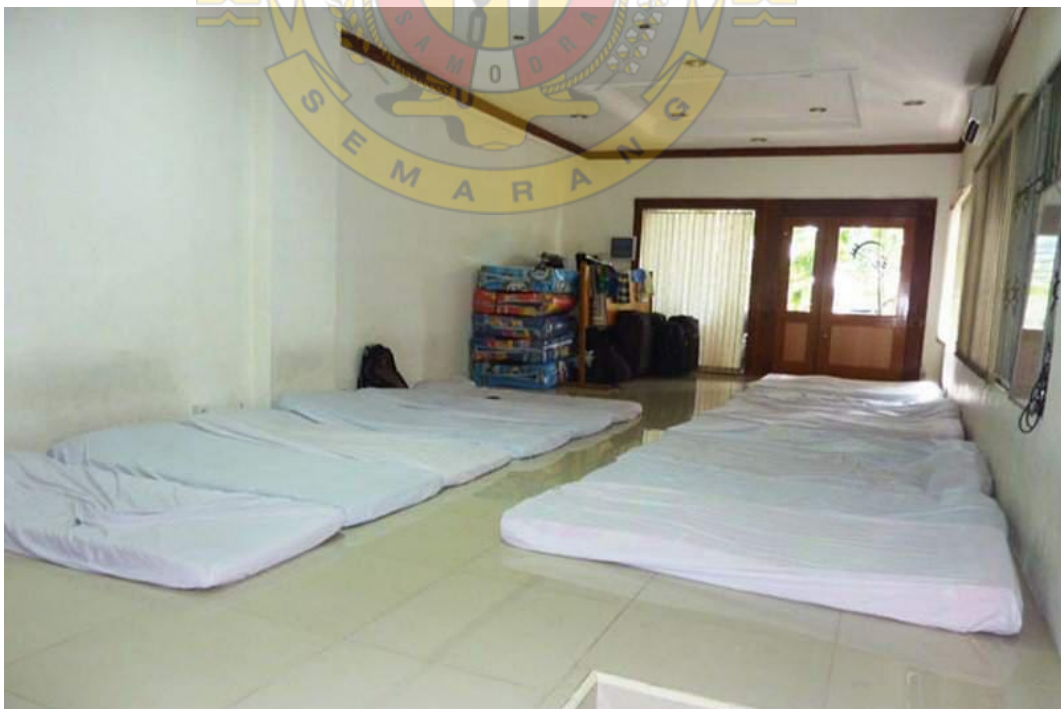
Crew mess room