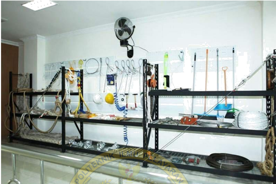
Deck rating education materials