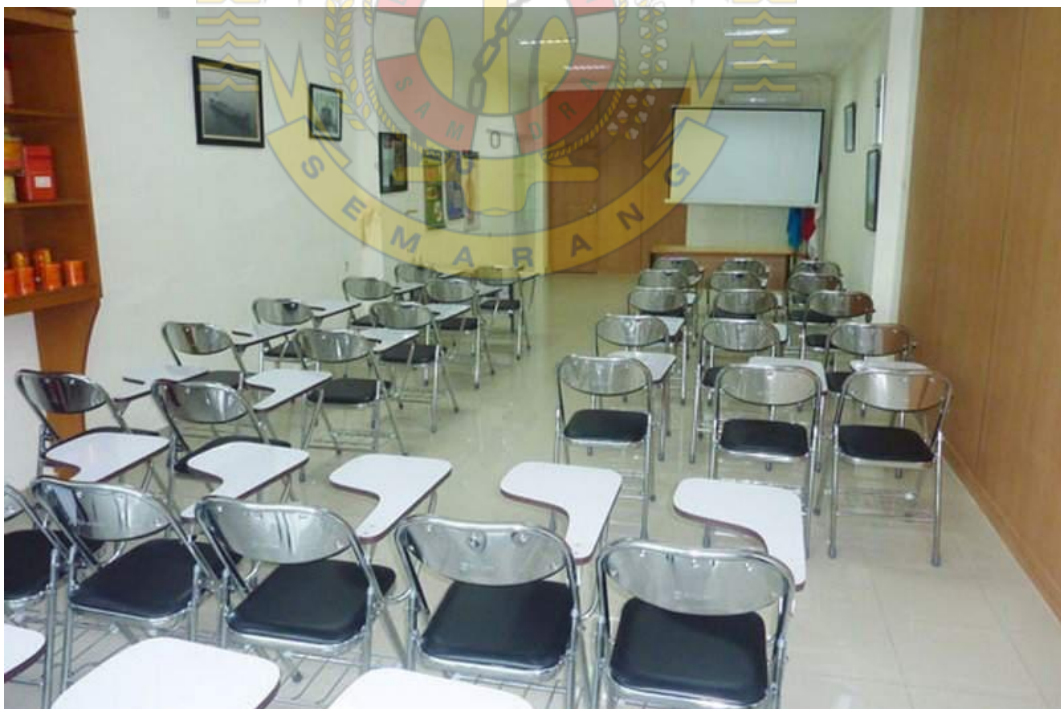
Education and training room 1