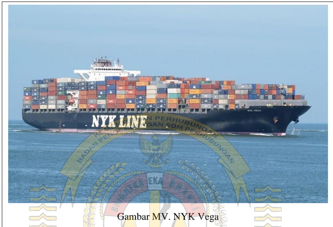
Gambar MV. NYK Vega