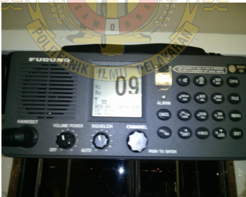
Gambar. very high frequency (VHF) MT. Sele/P.3006