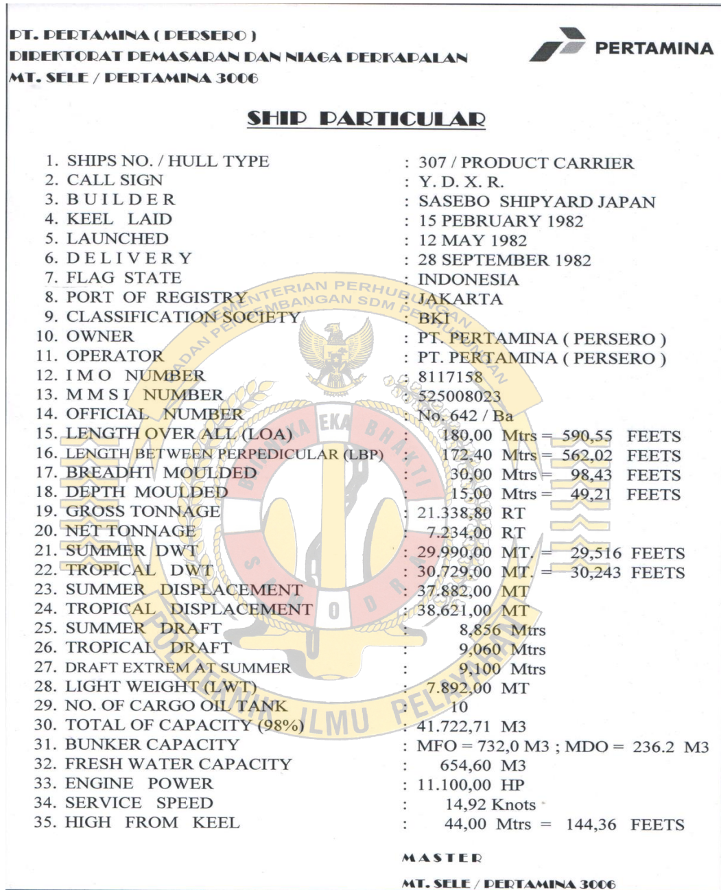
Gambar. Ship Particular MT. Sele/P.3006