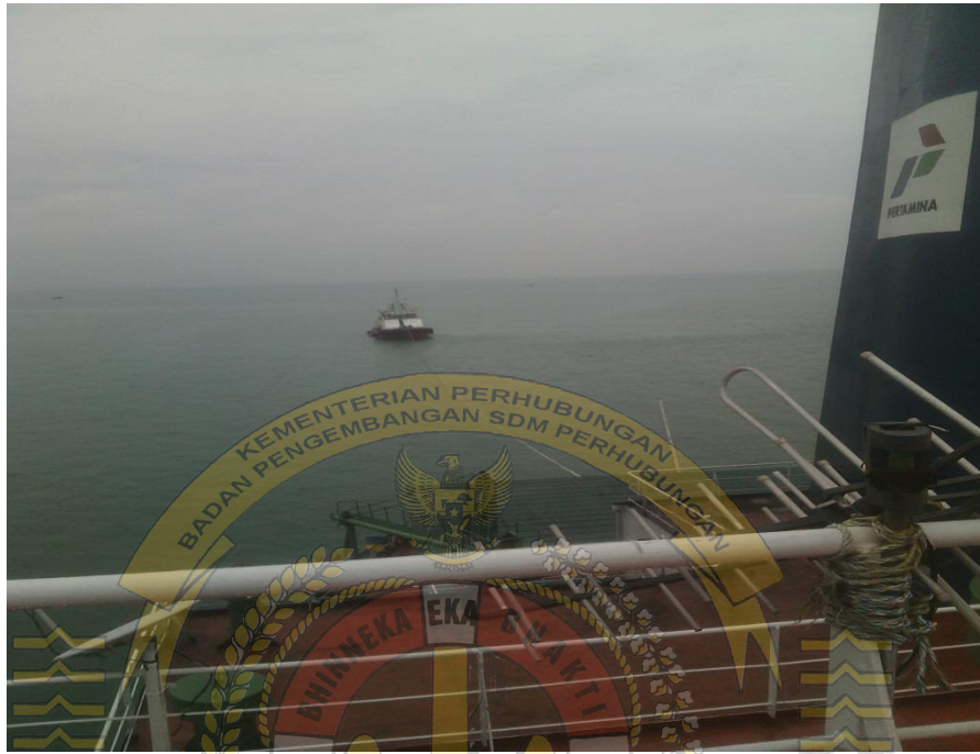
Gambar. Tali tunda yang terikat pada kapal tunda