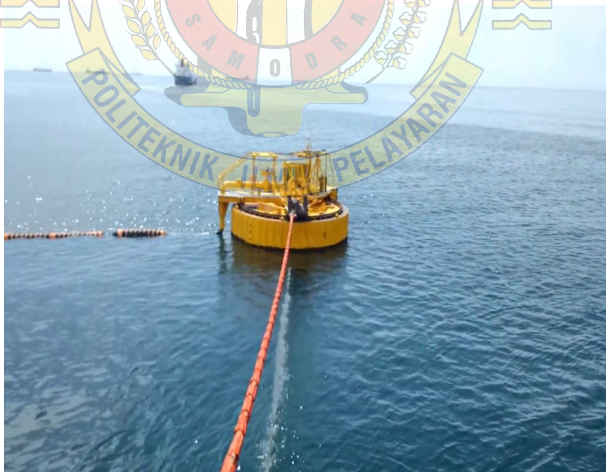
Gambar. Pengangkatan hawser (tali tambat di SBM)