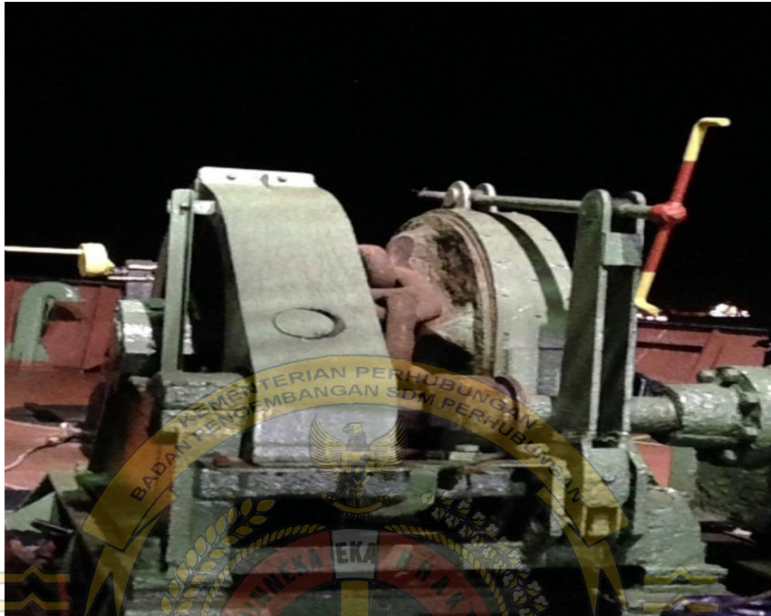
Gambar. Winch MT. Sele/P.3006