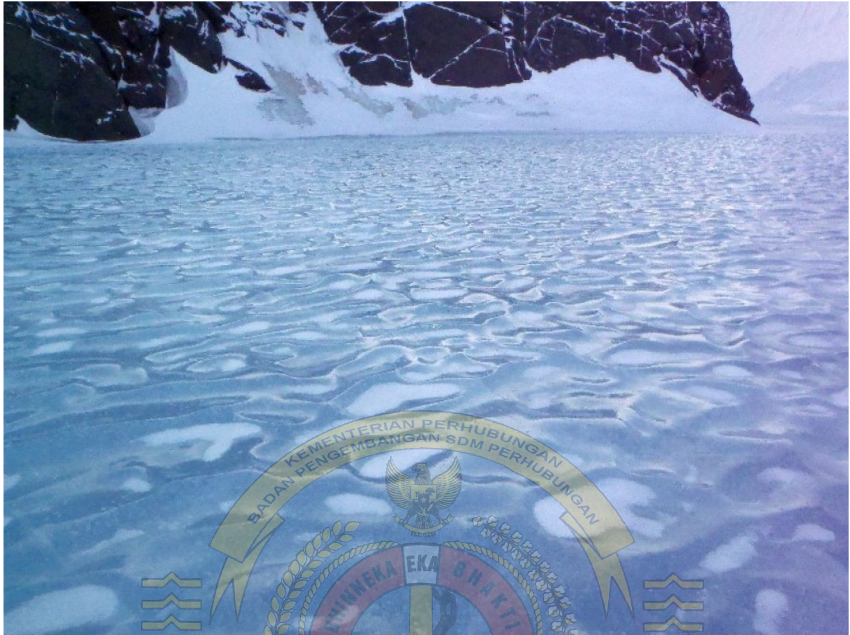
6 .ICE BERG