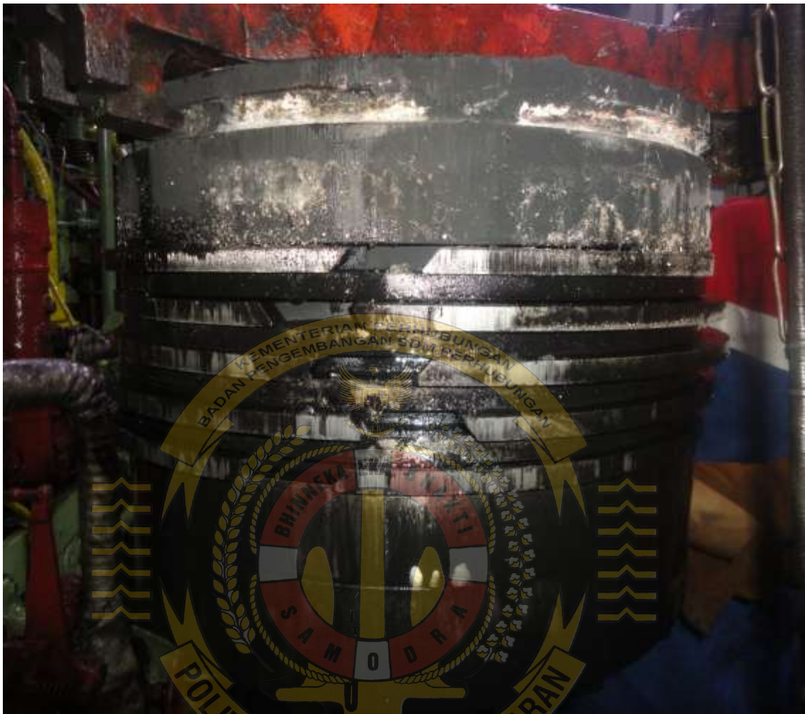
Gambar piston ring piston main engine cylinder no.7 MT. Pungut