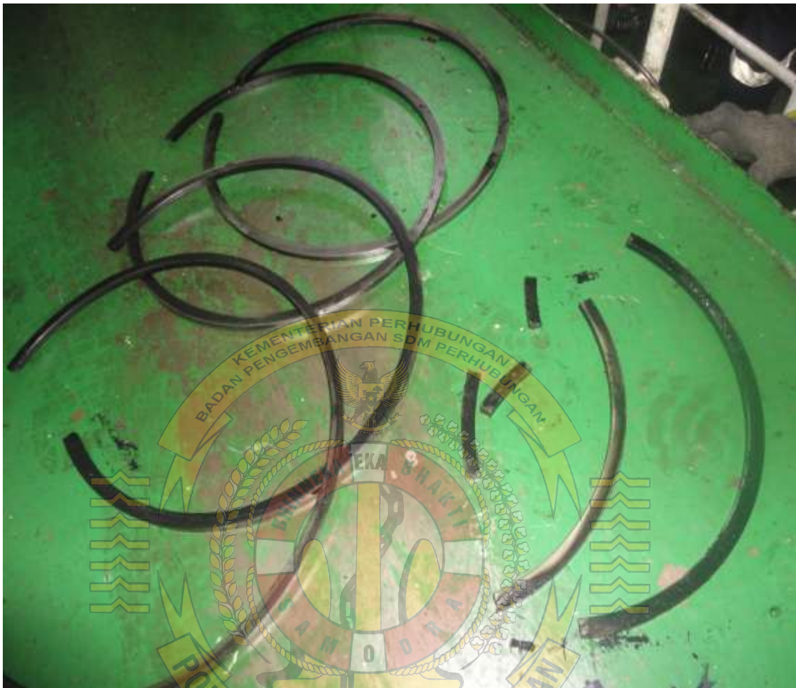
Gambar patahnya ring piston main engine cylinder no. 7 di MT. Pungut