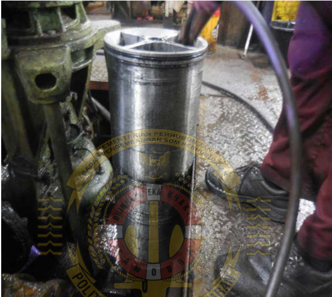
Gambar filter lo