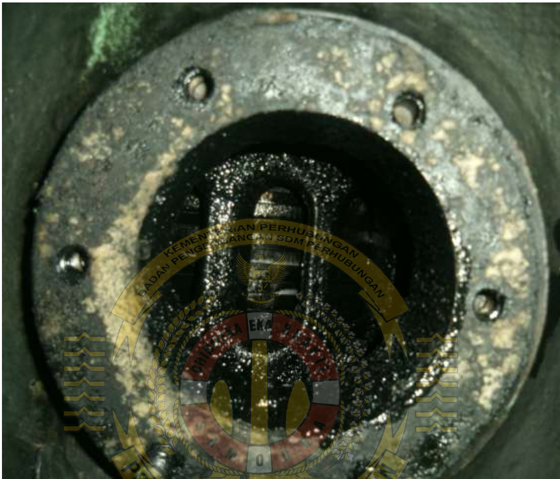
Gambar pengecekan keadaan ring piston main engine cylinder no. 7 di MT. Pungut