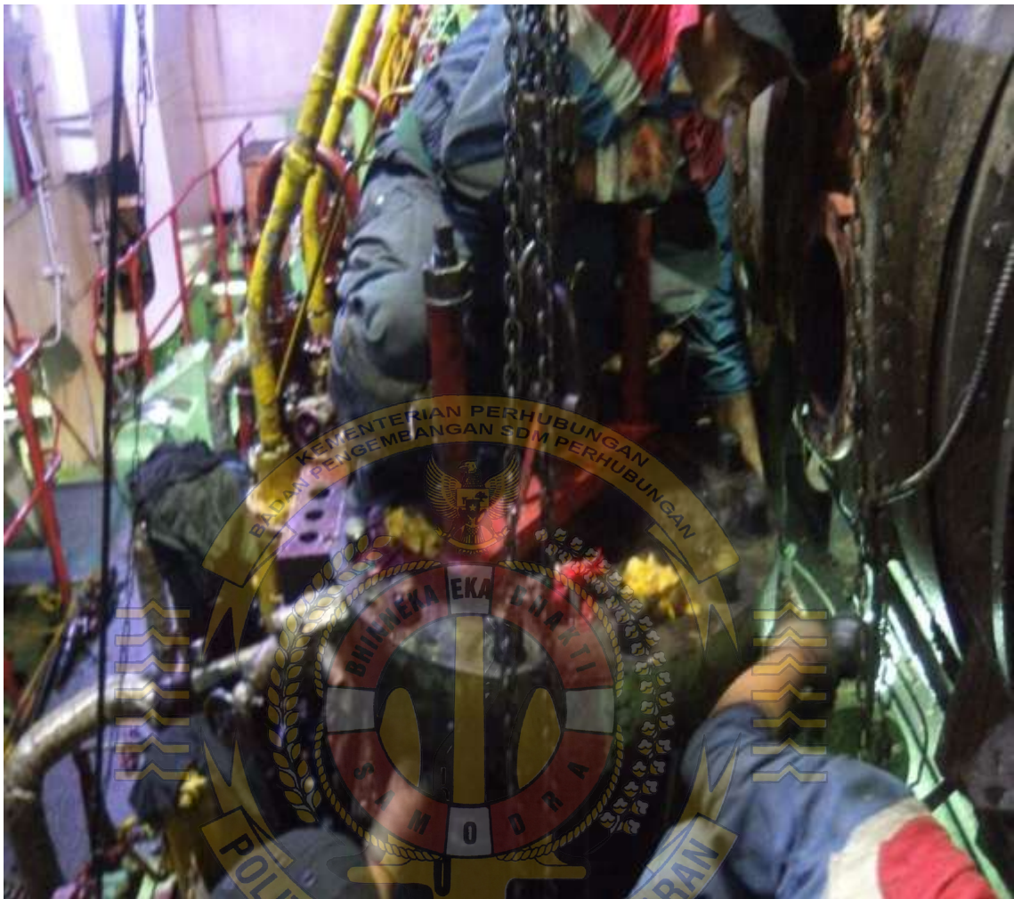
Gambar over haul main engine cylinder no. 7 MT. Pungut