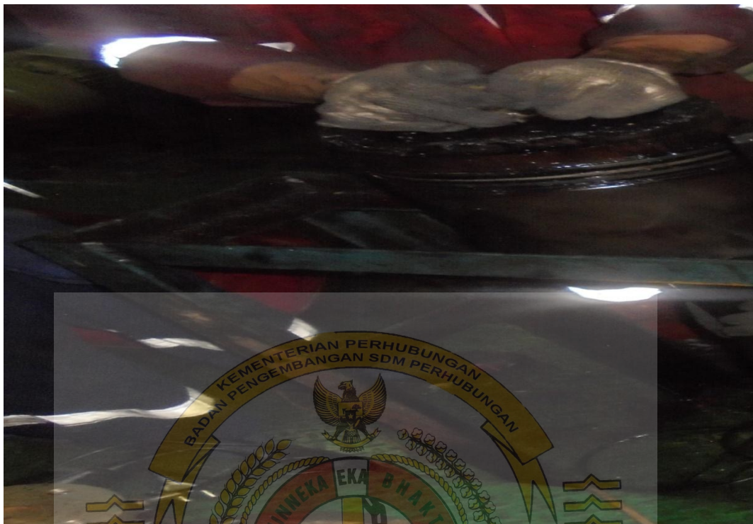
Gambar 4.5 Overhaul piston