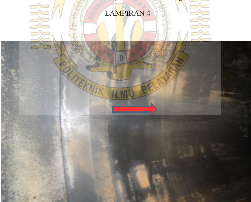
Gambar : 4.4 Cylinder liner aus