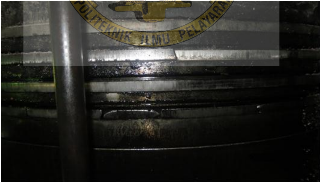
Gambar 4.1 Ring piston patah