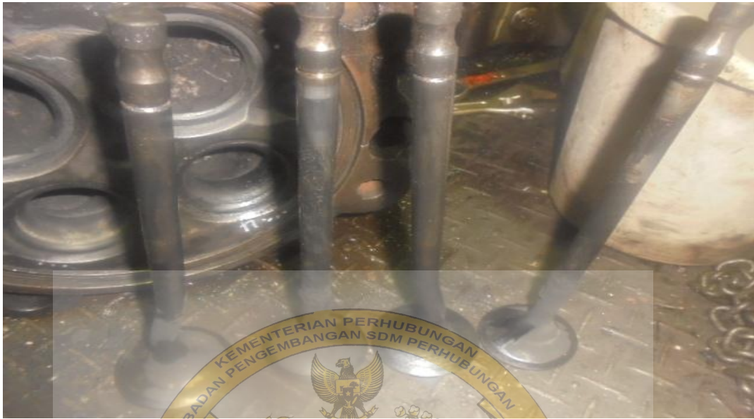
Gambar 4.3 Katup inlet dan outlet bengkok