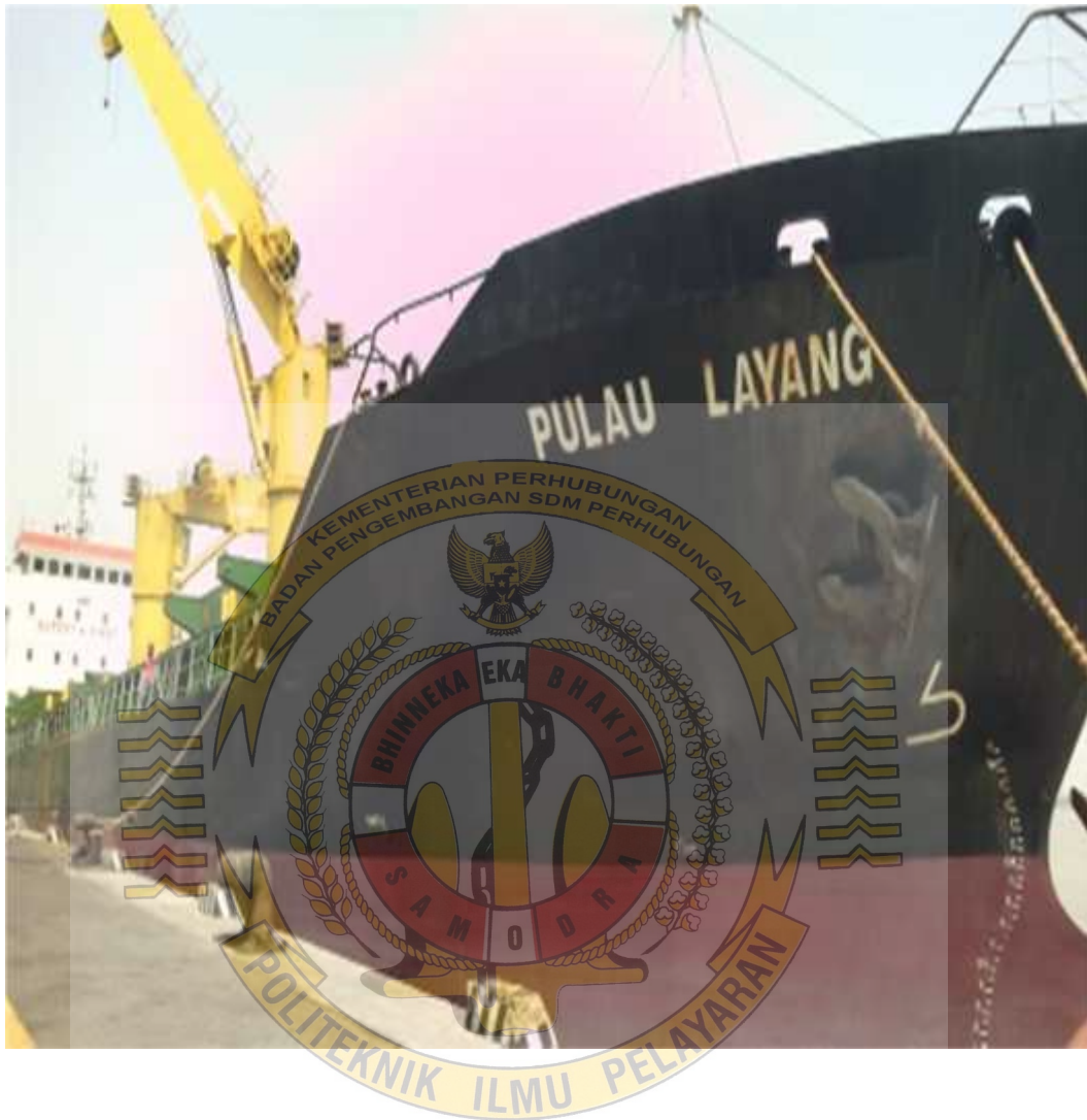
Lampiran 3 : Kapal MV. Pulau Layang