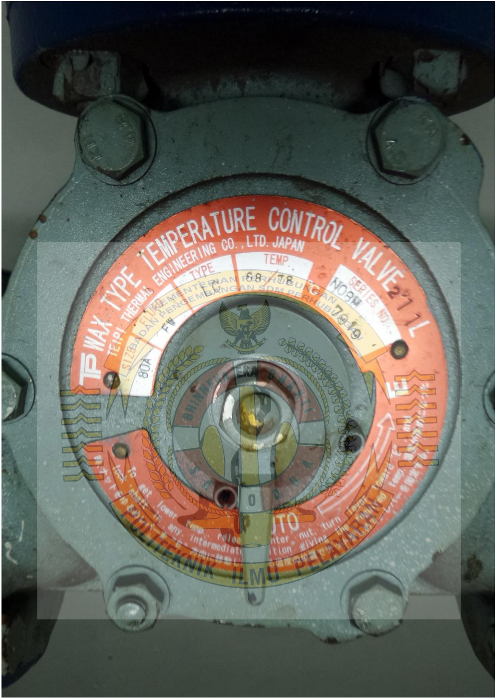
Temperature Control Valve