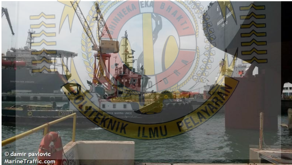
Harbour Tug Marina Unice