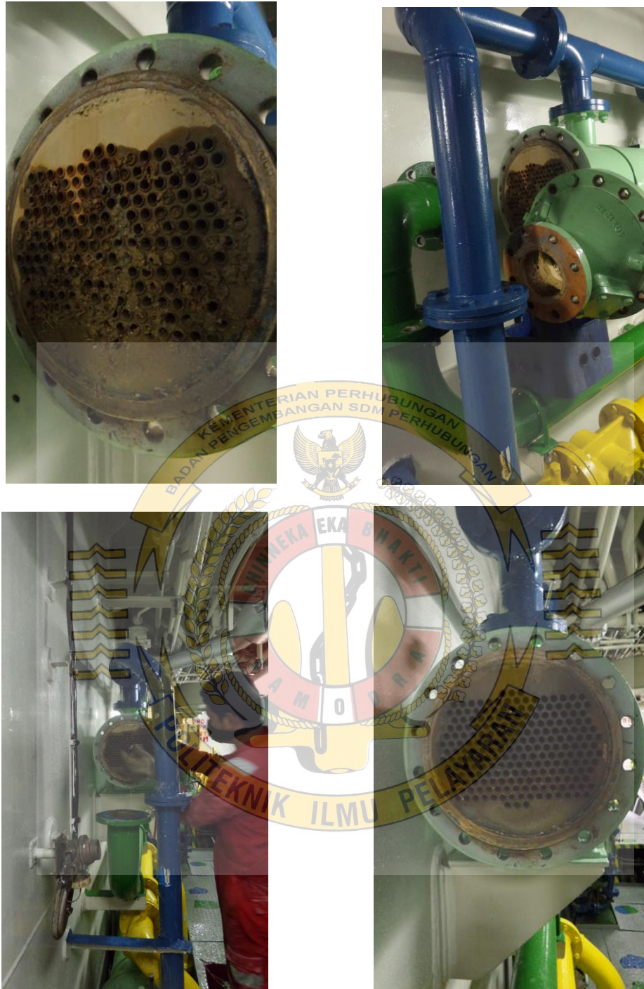
Perawatan Fresh Water Cooler