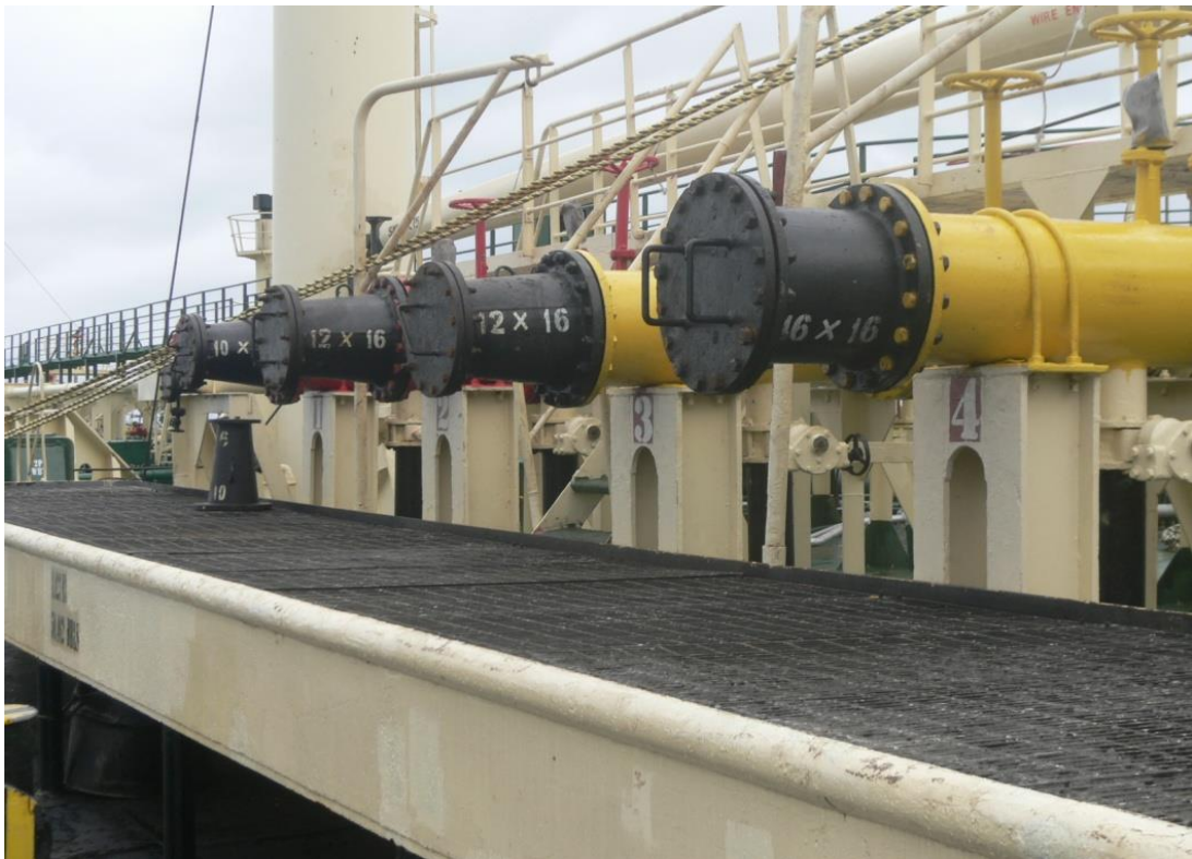
Gambar 3. Cargo manifold