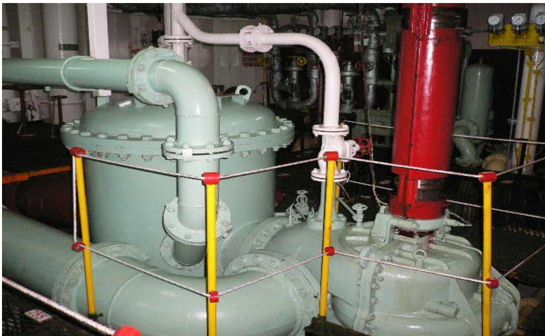
Gambar 2. Cargo Pump