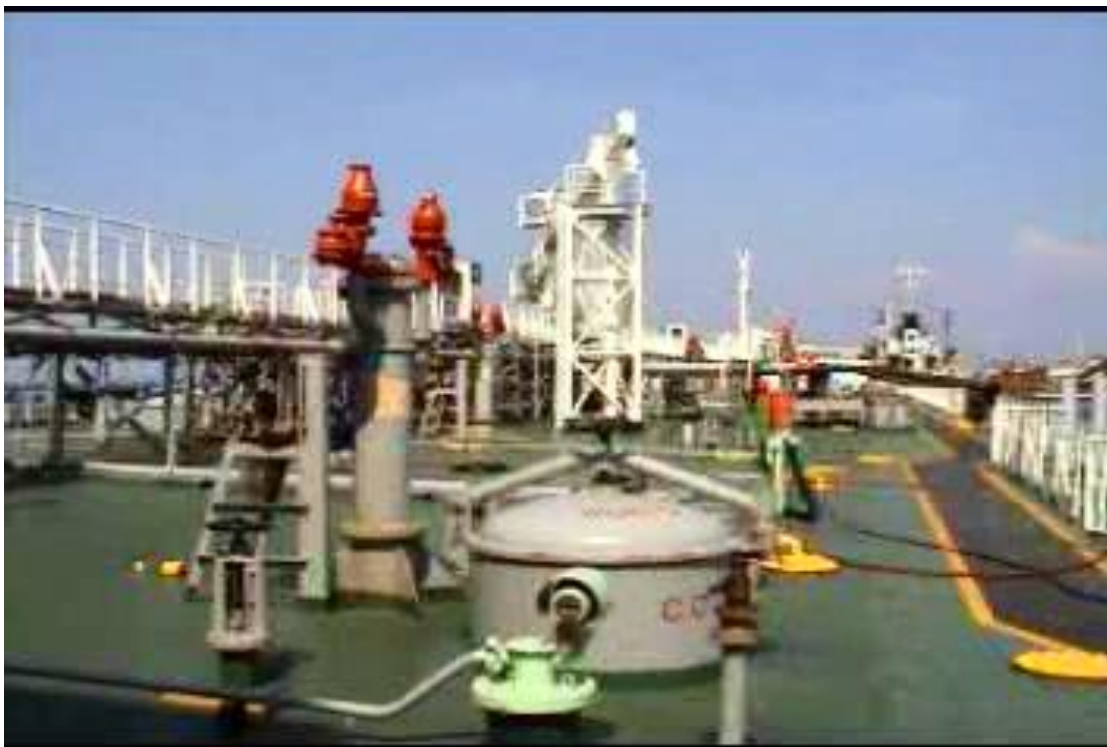
Gambar 6. manhole