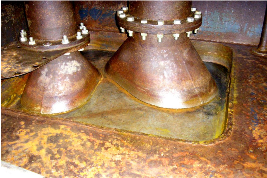
Gambar 7. Muatan yang masih tersisa di sekitar bellmouth akibat pelaksanaan tank cleaning yang kurang optimal.