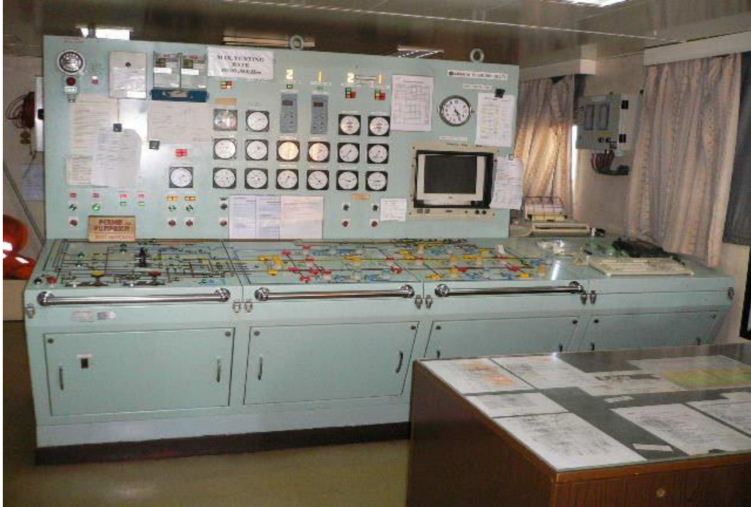
Gambar 1. Cargo Control Panel yang terletak di CCR ( Cargo Control Room)