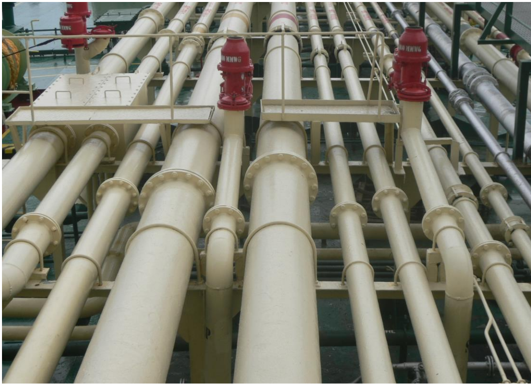
Gambar 5. Pipe Line cargo