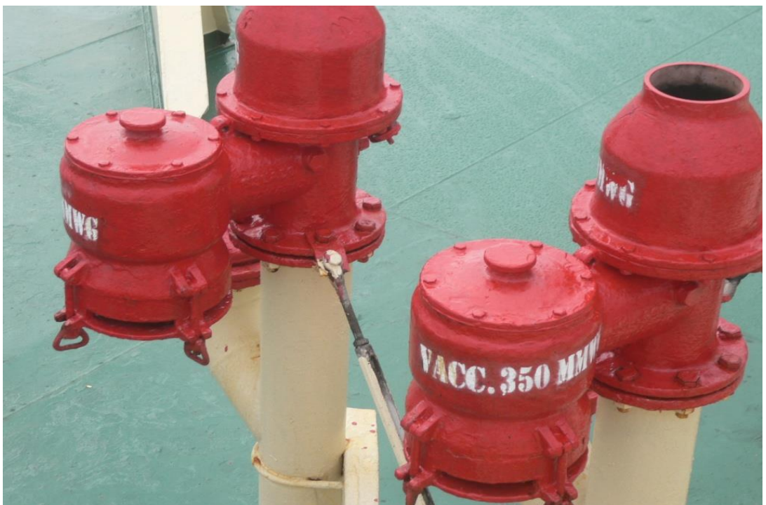
Gambar 4. PV Valve