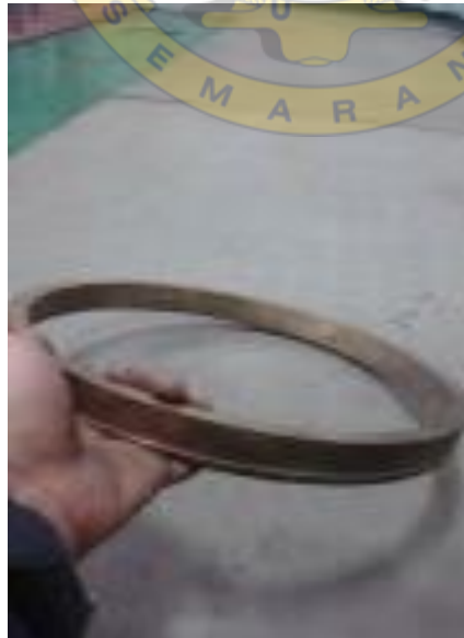
Gambar: Mounth ring dalam pompa bilge palka