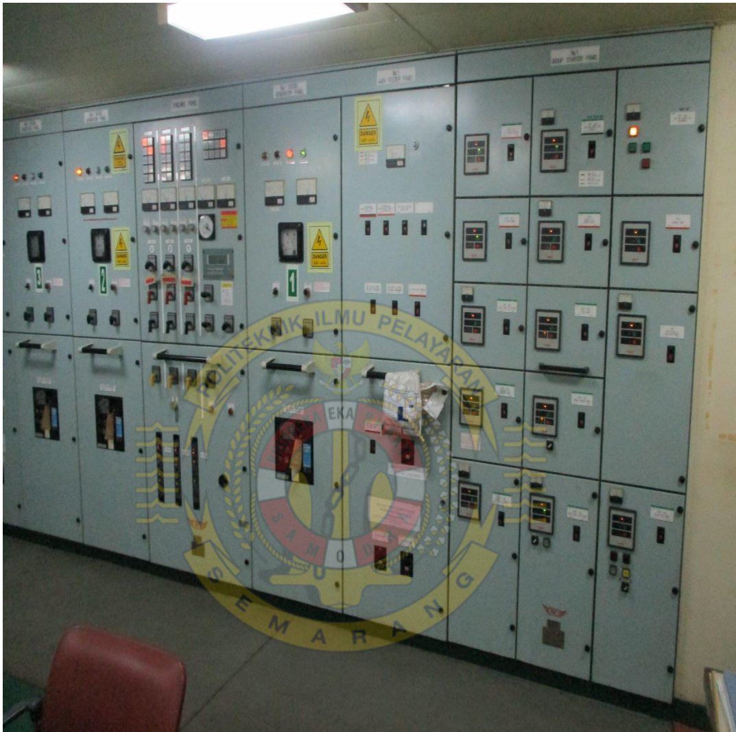
Gambar: Control panel engine side pompa bilge palka