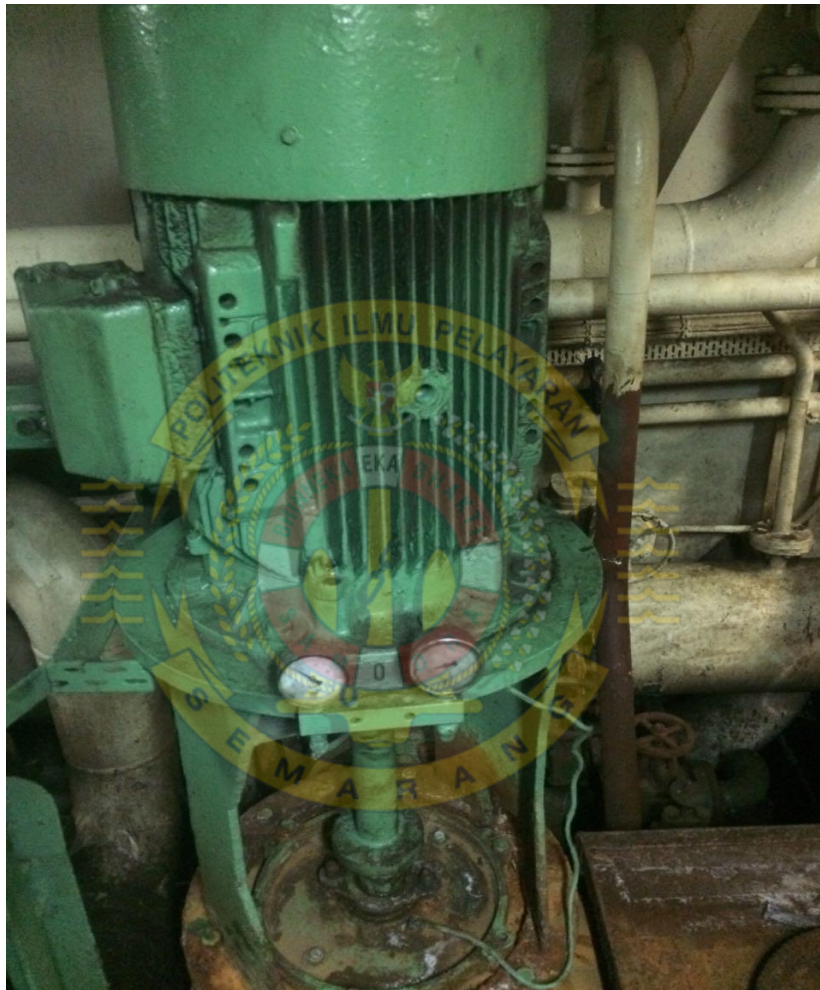
Gambar: Pompa bilge palka