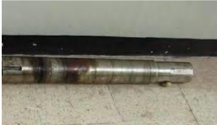
Gambar: Ausnya shaft pompa akibat gesekan Di MV. KT 02