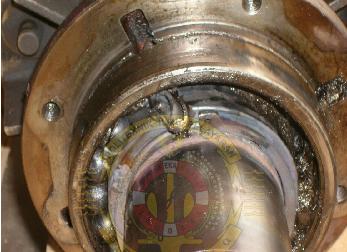
Gambar: Pecahnya ball bearing pompa bilge palka