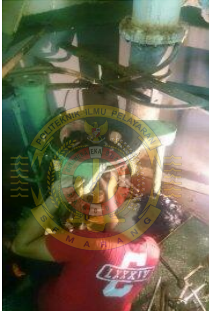
Gambar: Overhaul pompa bilge palka