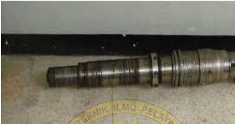
Gambar: Bengkokny shaft pompa akibat getaran tinggi